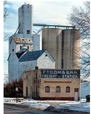
Former freight station and grain elevator in Boone