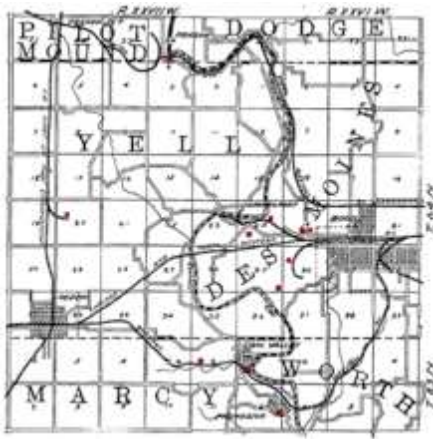
Map of the Boone area from 1908, showing the railroads and coal mines (shown in red) of the region.

"Montana"; [5] it was renamed to Boone in 1871. [6] The nearby town of Boonesboro was also