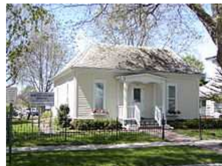
Birthplace of First Lady Mamie Doud Eisenhower, 709 (formerly 718) Carroll Street, Boone, Iowa