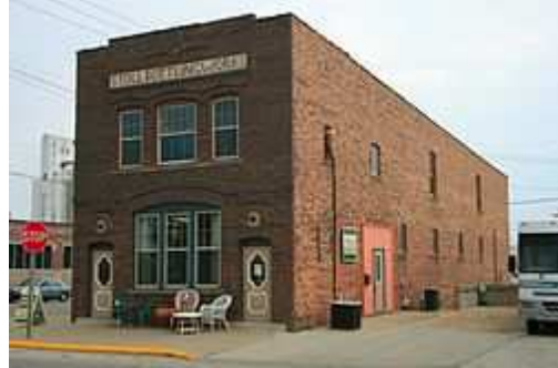
Stoll Bottling Works Building in Boone