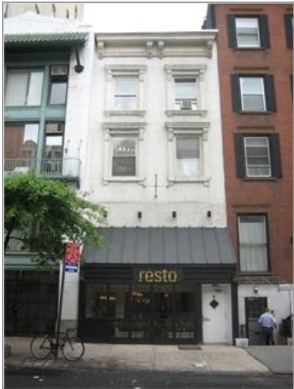
Asking Prices Retail for Sale New York, NY ($/SF)