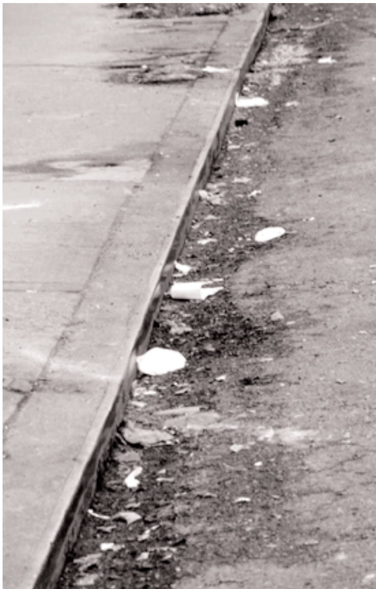
Failure to Sweep 18 Inches into the Street See "Sidewalks and Gutters"