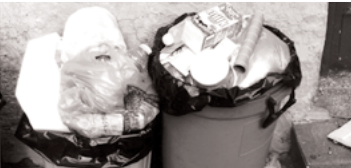
Uncovered Receptacles See "Receptacles," "Covered" and "Proper"