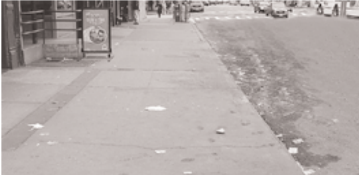
Dirty Sidewalk See "Sidewalks and Gutters"