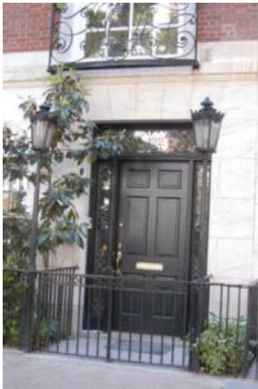
122 East 70th Street: one of the last deals of 2012.